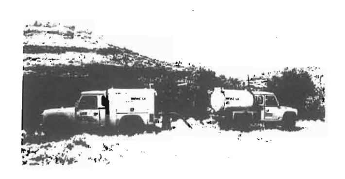
Fig.3 BREVAC LA equipment in action

As regards disposal options, the cost comparisons are difficult to work out with much confidence, but disposal by trenching or into ponds where land is available are suggested to be the most economical solutions for the Lesotho data.